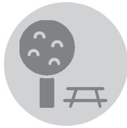
Parks and Gardens